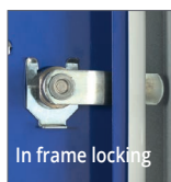
In frame locking

Versatile, hard-wearing and reliable, our lockers provide quality, choice and security as standard. But don't just take our word for it - our lockers meet the testing requirements of the British Standard for Clothes Lockers BS 4680: 1996 'Standard Duty'